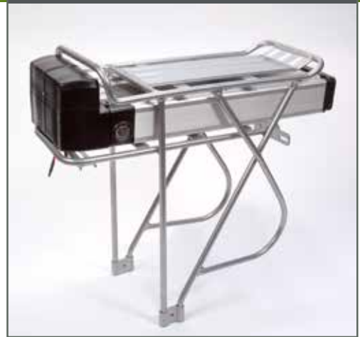
REAR RACK - MODEL (back carrier type)