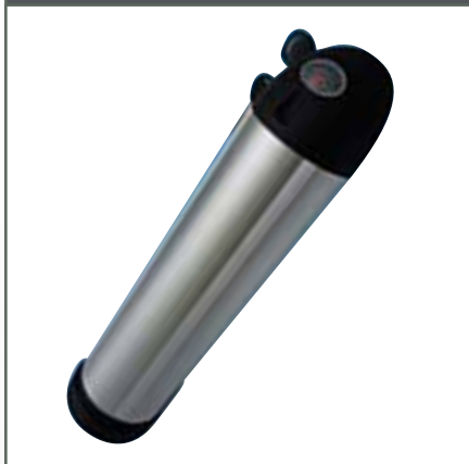
KETTLE - MODEL (for water kettle position)