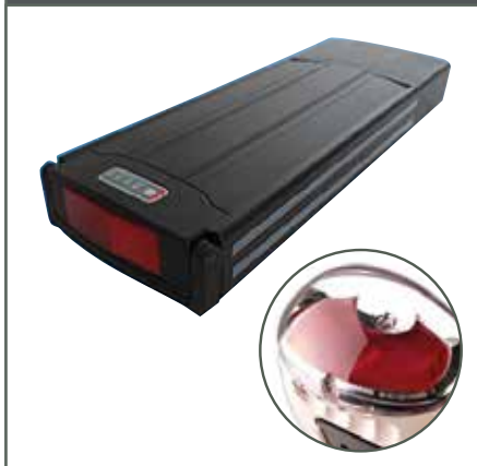
PVC REAR RACK - MODEL (back carrier type)