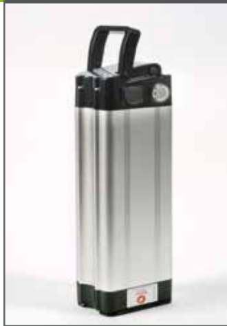
SLIVER FISH - MODEL (slide-in type)