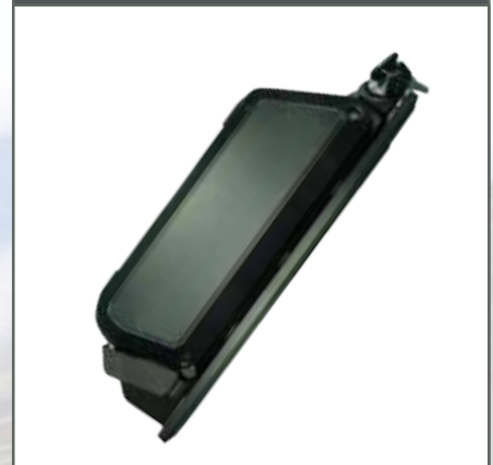
PVC KETTLE - MODEL (for water kettle position)

Li-ion (Lithium-Ion) batteries have the following advantages in comparison with other older battery technologies :