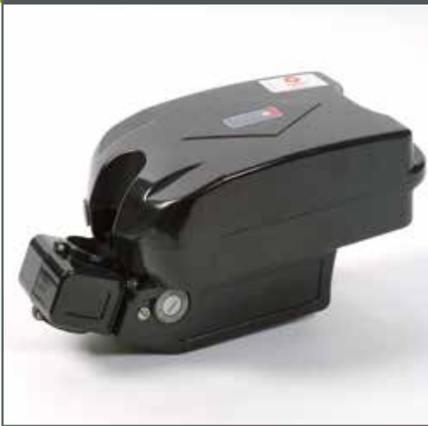
FROG - MODEL (saddle fixing type)